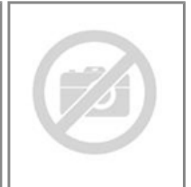
MPU-08 ext.PSU Atomic3000 P/N: 91611085