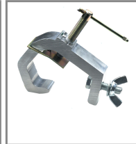
G-Clamp P/N: 91602003