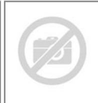
MPU-02 ext.PSU Atomic3000 P/N: 91611084