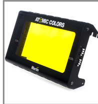
Atomic Colors for Atomic 3000 P/N: 91611086