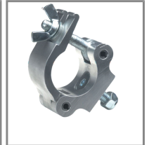
Half-coupler clamp for Ø50 P/N: 91602005