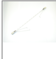
Lamp MAX-15 Strobe, Xenon, EU P/N: 97010307