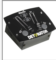
Detonator, Atomic Remote Ctrl. P/N: 90760020